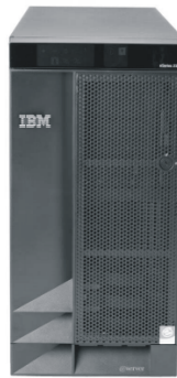
1 x IBM xSeries 235 1 x 3.2GHz/1MB Xeon 3 x Mylex AcceleRAID A352 Adapters 1 x 36.4GB Drive